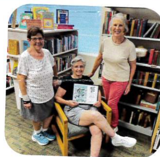
Our wonderful volunteers!

Since June, Dee's Attic Bookstore has continued to thrive as a vibrant hub for book lovers and community engagement. One of our key highlights was the Summer Book Sale, which was a great success! Drawing in record foot traffic, selling 4,722 books, and raising more than $7,200 for our programs. Following the sale, we proudly donated the remaining books to four local community organizations, helping to spread the love of reading throughout our community. We've also introduced monthly themed pop-up sales featuring curated collections such as science fiction, leather-bound classics, children's books, geography titles, and brand-new fiction. In October, we launched a special "Trick or Treat" sale featuring like-new paperback fiction, which was a hit with both new and returning customers.