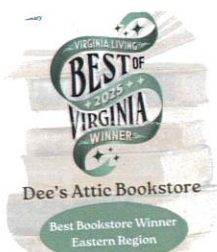
Best of Virginia