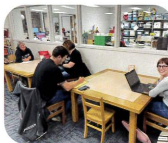
LCL Creative Writing Group