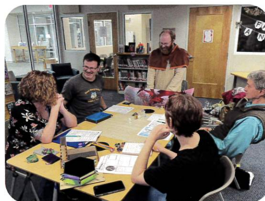
Dungeon & Dragons Guild Members