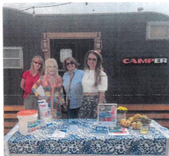
September 14 fundraiser at CAMP with the Band from Misfit Beach.