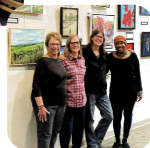
LCL Art Display - Artist