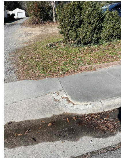
Item 12 – Major sidewalk and curb heave at 60 Steamboat Road