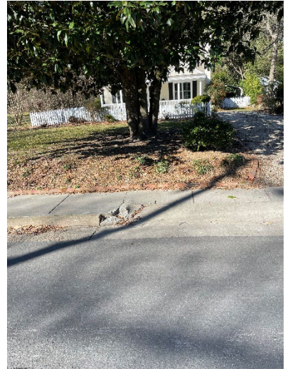
Item 11 – Both curb corners deteriorated at entrance of Bussels Lane at the next to 116 Steamboat Road